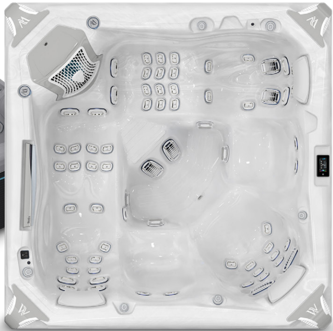
↑ Premium edition